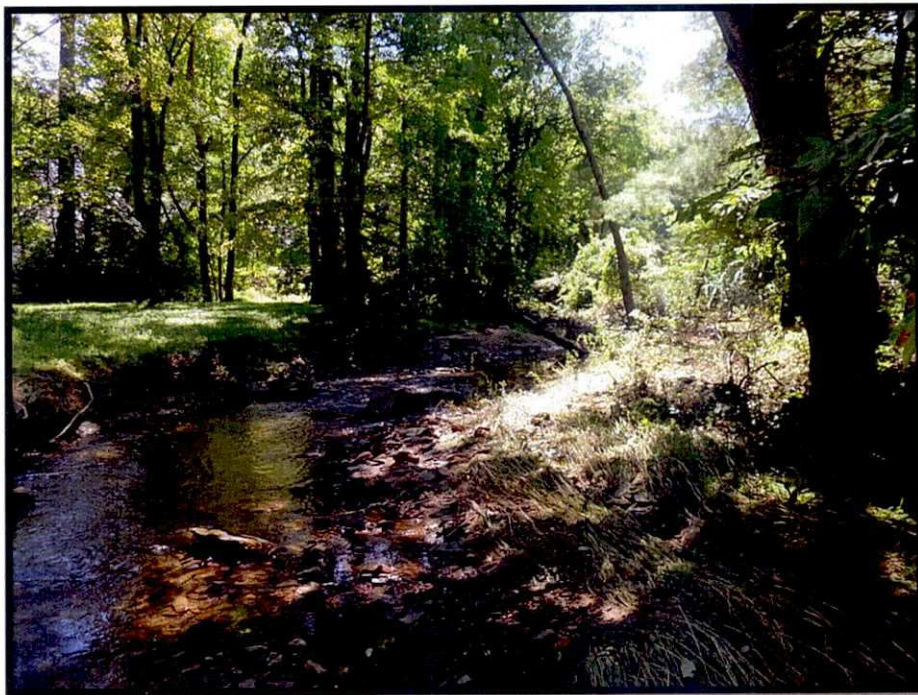
Debris at upstream