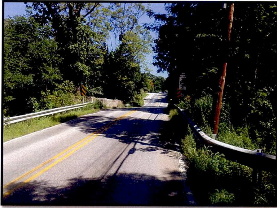
Figure showing near approach