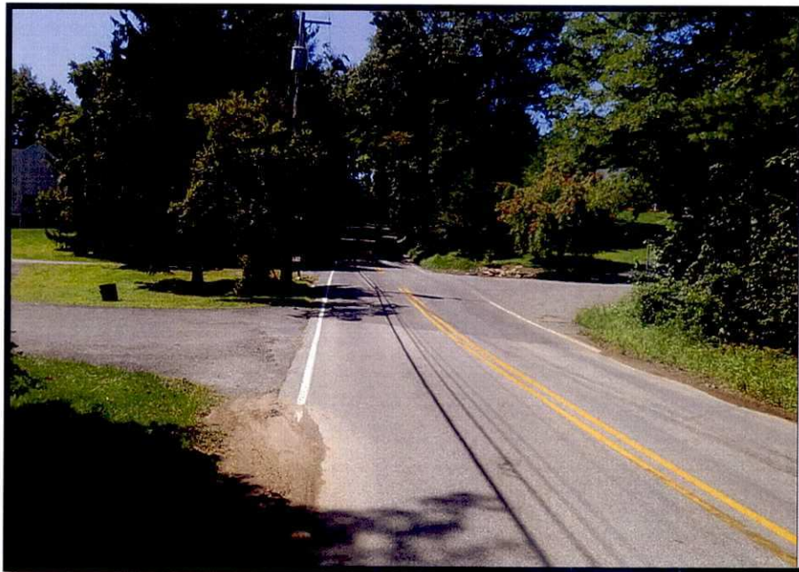
Figure showing far approach