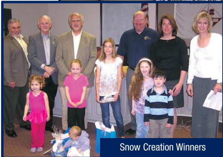
Snow Creation Winners