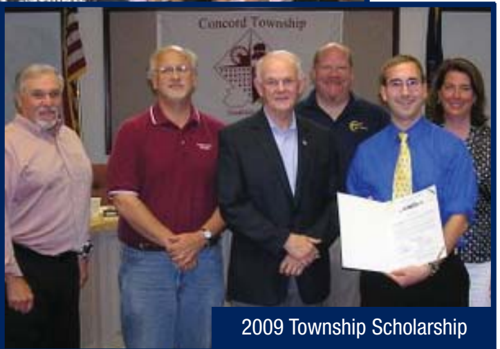
2009 Township Scholarship